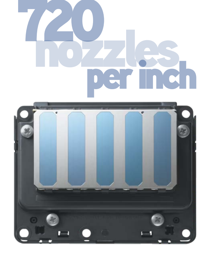
Epson PrecisionCore TFP Actual print head used in the SureColor F-Series printers