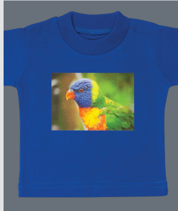
Produced with: LASER-1-OPAQUE®

LASER-1-OPAQUE® Heat Transfer Paper is easy to use for transferring laser photo-quality images or other graphics to dark colored materials, offering a soft, supple transferred image that is vibrant and durable – and will withstand many laundry cycles, regardless of the model of laser printer or copier.