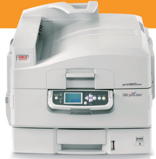
The OKI proColor™ Series pro920WT Color Printer

1-Year On-Site warranty3 for lower operating costs