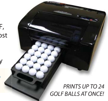
PRINTS UP TO 24 GOLF BALLS AT ONCE!