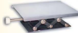
Flatbed Lift Attachment