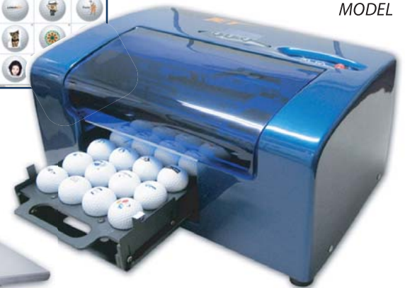
LogoJET Express ~ Item # LJEXP

LogoJET Express (above) is our most compact desktop printer that can print up to 16 golf balls with 16 different images simultaneously. Not only is it compact, but it's also "out of the box friendly". All the trays and software are specially fitted for the printer, so all you have to do is load the product and simply press print!