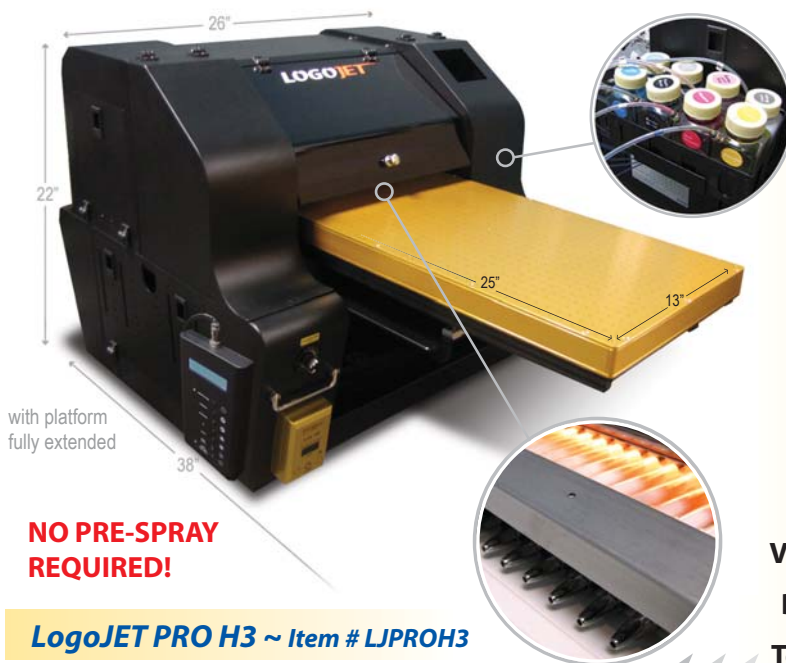
with platform fully extended